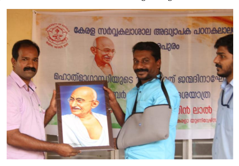
Principal, KUCTE, Kumarapuram presenting the momento to Syndicate Member.