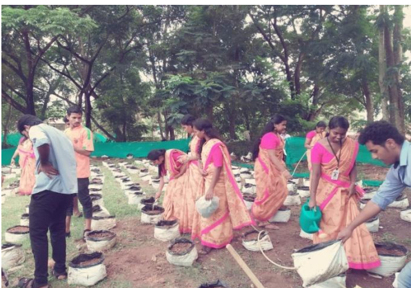
Harvesting and vegetable garden making