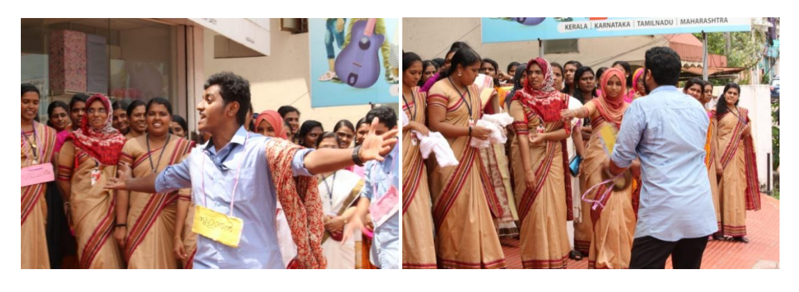
Street play conducted by 2^{nd} year B.Ed. students.